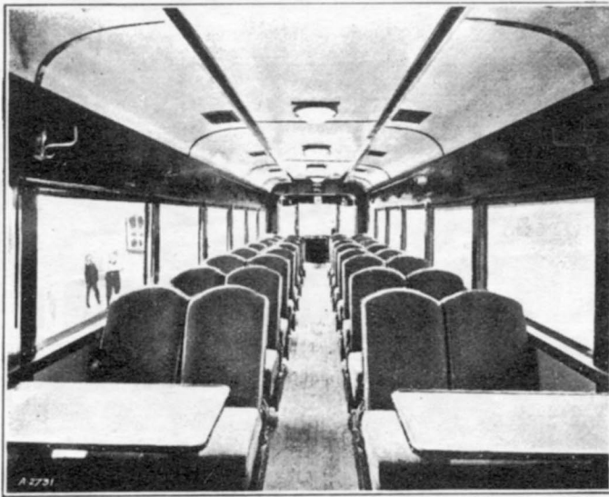
Interior of passenger cars or coaches upholstered in plush, smoking compartment in leather.

grill work similar to that used on open end observation cars. The interior arrangement was like the motor cars except that a lounge section was provided at each end of the car.